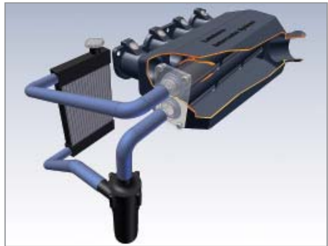
Laminova intercoolers in manifold connected with radiator.

The intercooler reduces hazardous emissions of e.g. nitrogen. The engine temperature becomes more even due to improved air distribution balance. This also decreases fuel consumption.