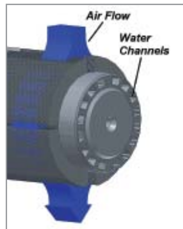
Air flow over the core.